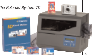
The Polaroid System 75

© 2004 "Polaroid and Pixel Design" is a trademark of Polaroid Corporation. Printed in the U.S.A. 3/04